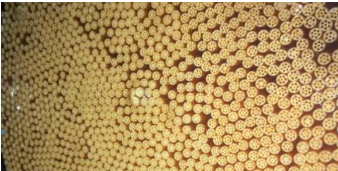
Visual check of membrane surface confirmed the improvement